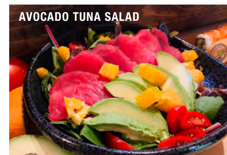
AVOCADO TUNA SALAD