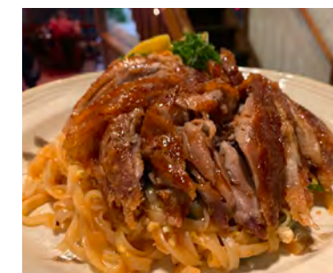
DUCK PAD THAI